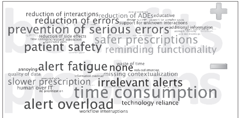
Figure 3 Tag clouds of the benefits (green) and problems (red) of automatic alerting as named by the physicians. Bigger letters indicate higher relative frequencies (normalized with regard to the different sample sizes). The biggest tag in the benefits cloud ‘prevention of serious errors’ was mentioned 88 times. The biggest tag in the problems cloud ‘time consumption’ was mentioned 138 times.

Both quantitative and qualitative results show that the majority of the physicians appreciate the benefits of alerting in CPOE systems by providing for safer prescriptions through the reduction of errors, especially the most severe ones and, hence, a general increase in patient safety. However, alerting should be better adapted to the clinical context and make use of more sophisticated ways to present alert information. The physicians also wish for less interruptive alerts that are prioritized to avoid possible overload of irrelevant alerts that may lead to alert fatigue. Interestingly, in almost all hospitals, the majority of the physicians did not think that automatic alerts would cost them too much time, despite time consumption was the most frequently nominated problem with automatic alerts in the free-text comments. One reason may be that only a minority of physicians is af-