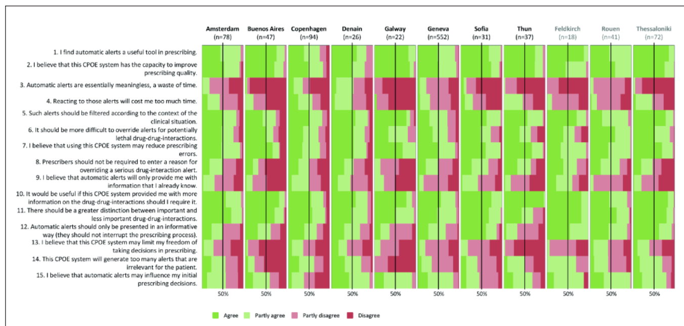
Figure 1 Relative frequencies of the answers to the 15 items from all hospitals. The hospitals without a CPOE system are indicated with grey letters. ‘No statement’ answers are not illustrated. Detailed frequency values are supplied in ► Supplementary Online File.